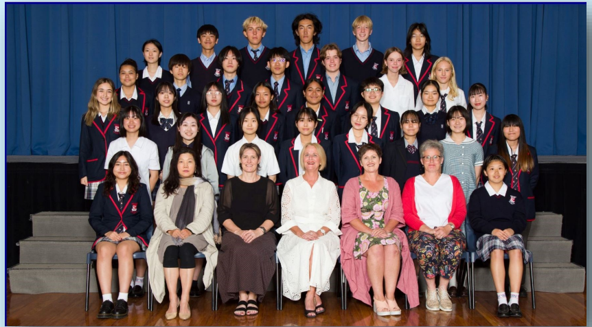
International Student Committee 2024